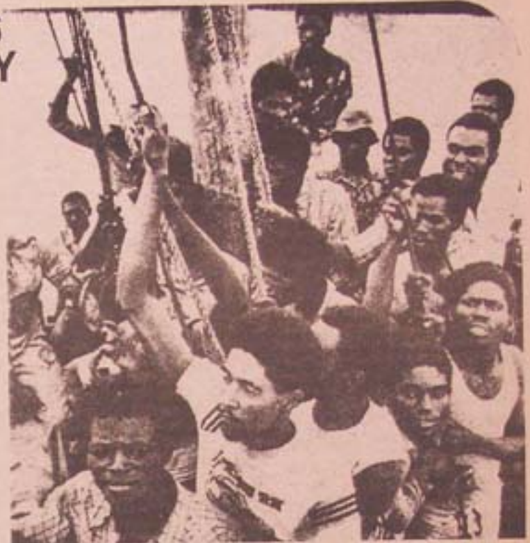
A crowded boatload of Haitian refugees. The U.S. continues to deny political asylum to some 30,000 Haitians in southern Florida.

The illegality of the INS efforts and the denial of due process to the Haitians is a key issue in the trial suit brought