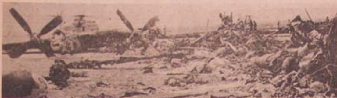
Wreckage from C-130 and helicopter in Dash-i-Kavit desert where U.S. commando raid to "rescue" hostages in Iran ended in disaster.